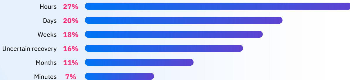
HOW QUICKLY DO YOU THINK YOU COULD RECOVER ?

However, when evaluating the time it would take for organizations to resume normal operations following a data loss catastrophe, market trends reveal intriguing insights. A notable 65% of respondents anticipate a recovery timeframe spanning days or longer. Surprisingly, 16% concede that they may never fully recover their critical data. This market trend raises essential questions about the alignment between confidence in data restoration and the practicality of recovery timeframes. It prompts us to consider whether the market comprehends the implications of potential prolonged data unavailability on business operations.